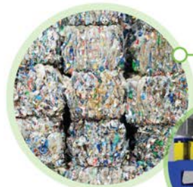
Post-consumer plastics are collected.